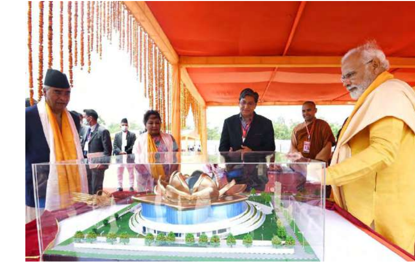
Innaugration of India International Centre for Buddhist Culture and Heritage at Lumbini by hon'ble prime minister Shri Narendra Modi.

India International Centre for Buddhist Culture and Heritage is proposed in Lumbini within the Lumbini Monastic Zone in Nepal. The building form is derived from the seven steps with alternating water bodies and landscaped steps to reach the main level with the prayer hall. This structure is designed to be inspired by the account of Lord Buddha's birth in this holy area. The pilgrims and visitors visiting this Center must be able to experience the divine surroundings and interpret and collaborate on the various facets of the teachings of Buddhism. The chosen site for the building is not only a pilgrimage site but also a UNESCO World Heritage site. The special status of the proposed site provides an opportunity to create a sustainable environment through architecture.