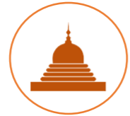
Maha Pari Nirvana